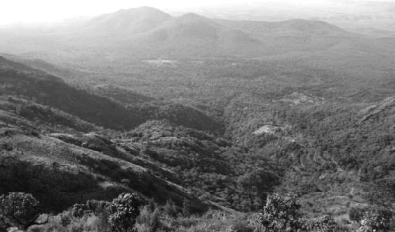
MudumalaiTiger Reserve in the Nilgiris district of Tamil Nadu

The hills, which are renowned for tea and coffee plantations, are considered sacred by the Toda tribe, who have lived there for thousands of years. The pastoral community believes that their gods and goddesses lived among them once and became a part of the sacred landscape over time.